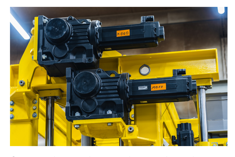
Concrete industry production machine manufactured by Mecmetal Oy.