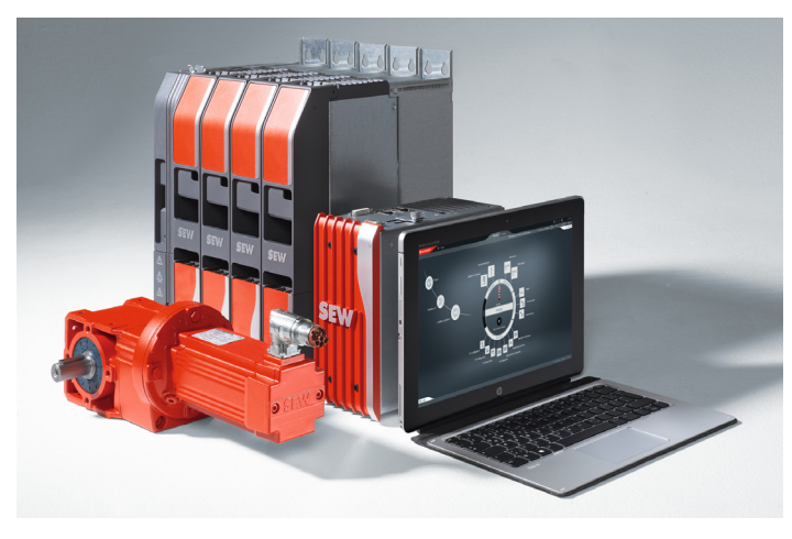
MOVI-C® modular automation system supplied by SEW-EURODRIVE Oy.